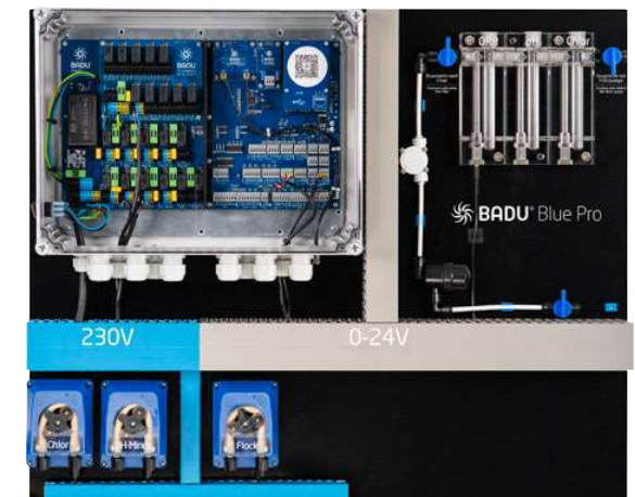
^ BADU Blue Pro

> Further information can be found on page 4 of our brochure.